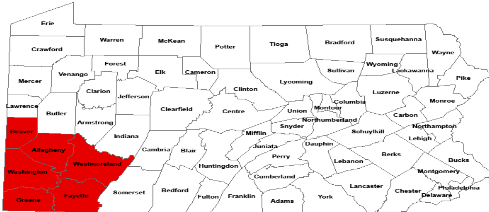
Figure 1. ICO Phase 1 Counties (shaded).